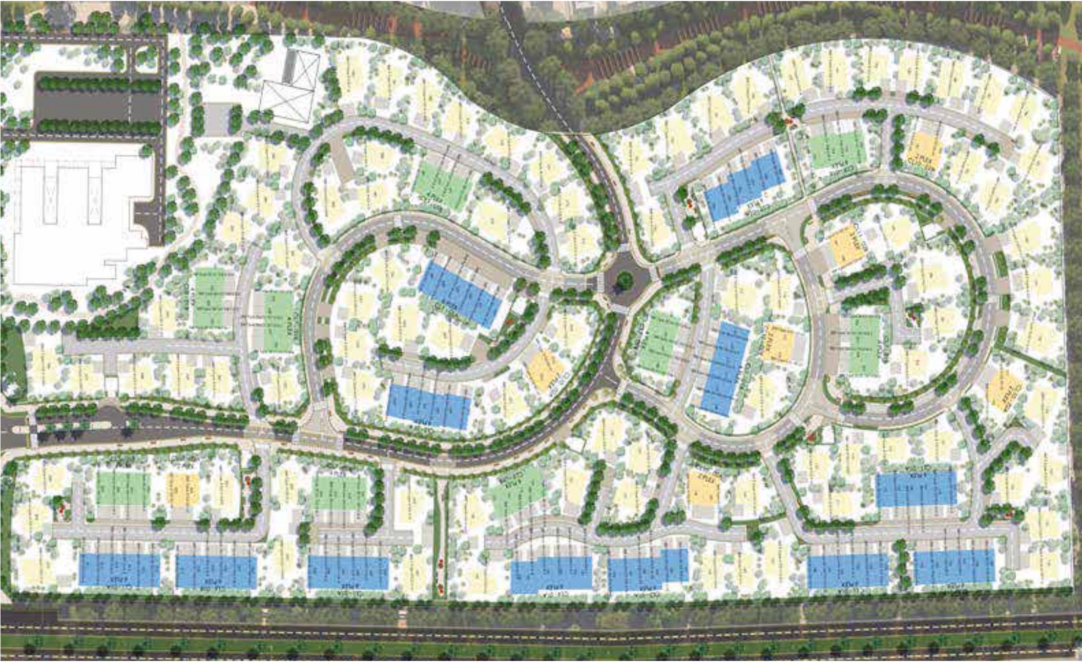
6-PLEX TOWNHOUSE 4-PLEX TOWNHOUSE SEMIDETACHED DETACHED VILLAS