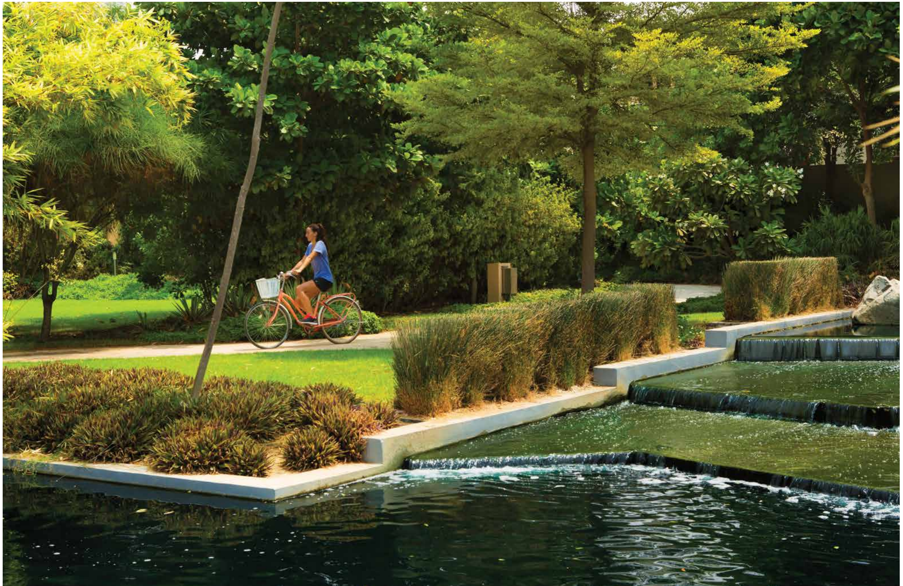
AL BARARI 6 KM CYCLING TRACK