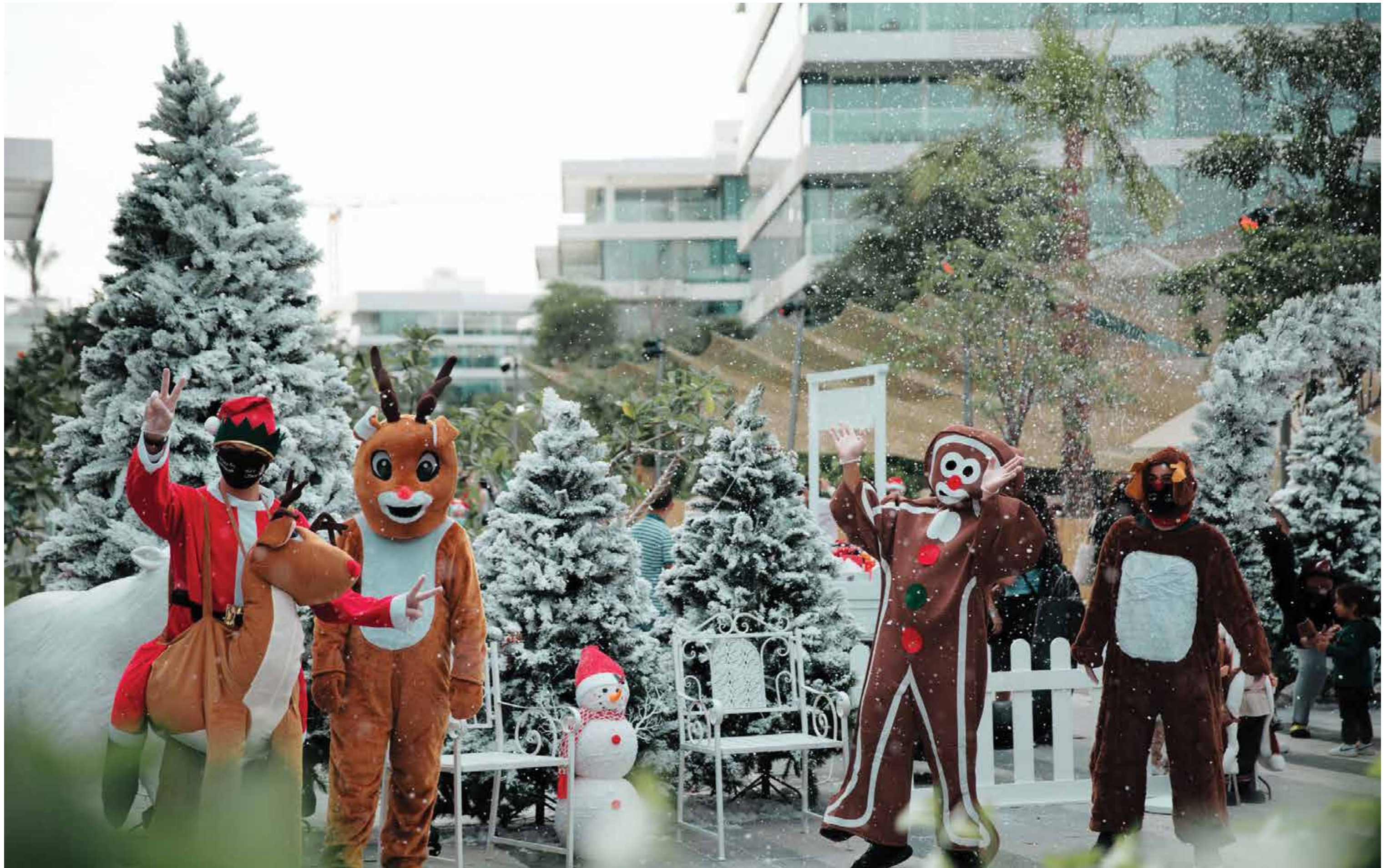
AL BARARI WINTER WONDERLAND 2020