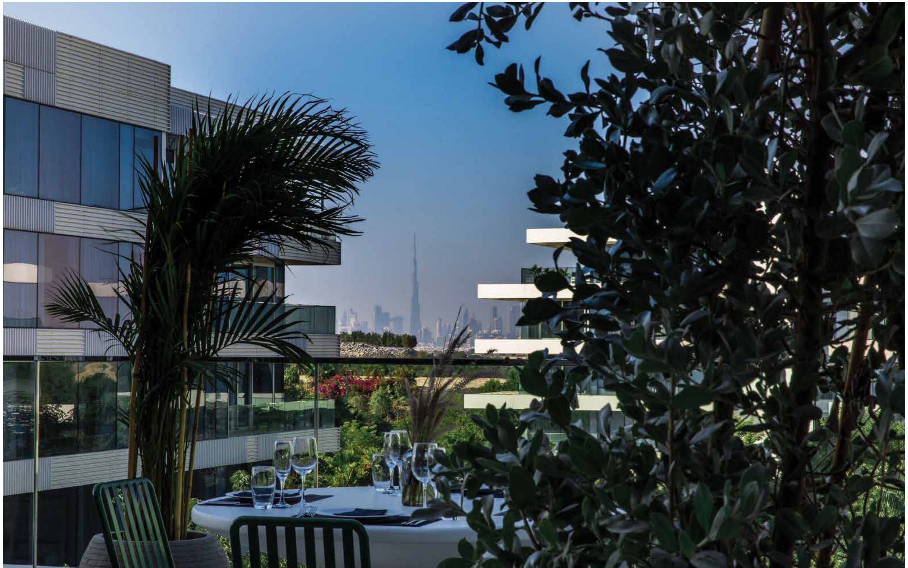
HIDEOUT LOUNGE & RESTAURANT