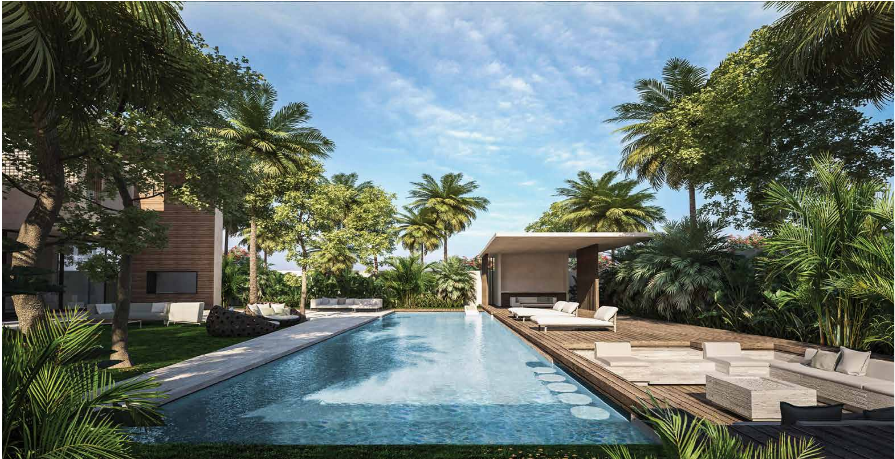
This villa offers a distinct quality of space enhanced by visual connections from the inside to the outside and between all the terraces on different levels.